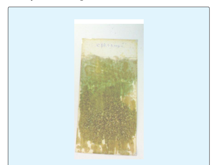
Figure 1: Thin Layer Chromatography of Cyclopiazonic Acid Standard separation by used direct spraying of the apparel Ehrlich's reagent.

In general, the TLC technique is simple and does not require special equipment, but most of the published methods suffer from the excessive time needed for analysis and / or inaccuracy of the obtained results. It had been shown previously that spray reagents may lead to variable results because the intensity of fluorescent color is dependent on many difficult-to-control factors such as time, amount of reagent applied to the sample spot, and development of background color.