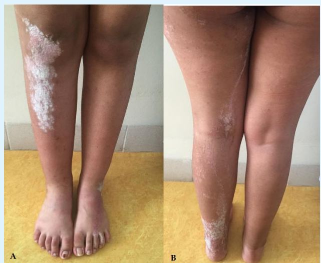
Figure 3: Erythematous and scaly plaques with linear disposition localised to the right leg, a) Anterior face, b) Posterior face.