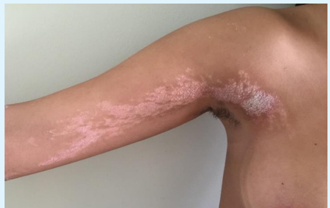
Figure 1: Erythematous-squamous plaques following the lines of Blaschko.

psoriasis linear and removed an interface lichenoid reaction (Figure 5). The patient was treated with a topical Clobetasol 0, 05%, without evident response. UVB phototherapy 3 times a week for 10 weeks had been associated. In 4 weeks there was a significant decrease of the plaques.