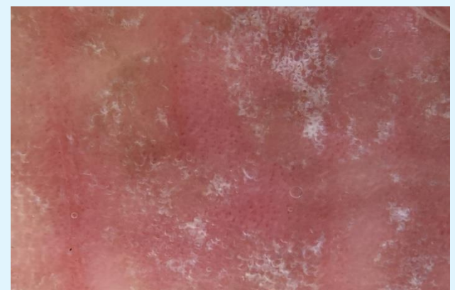
Figure 4: Dermoscopic image showed a homogeneous and regular dotted vascularization.