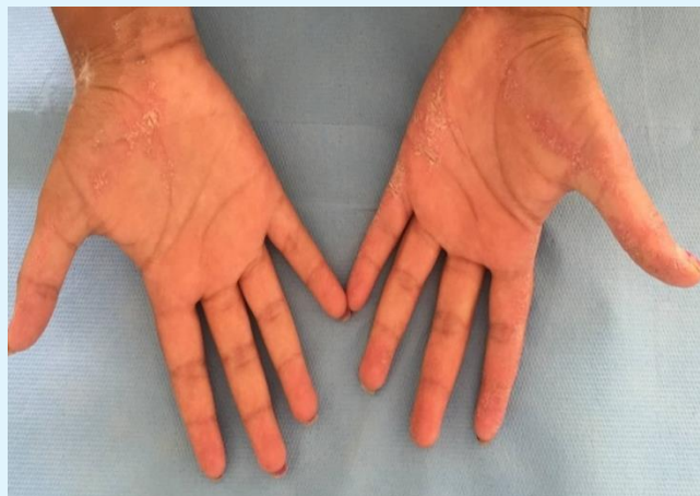
Figure 2: The palmar localisation.