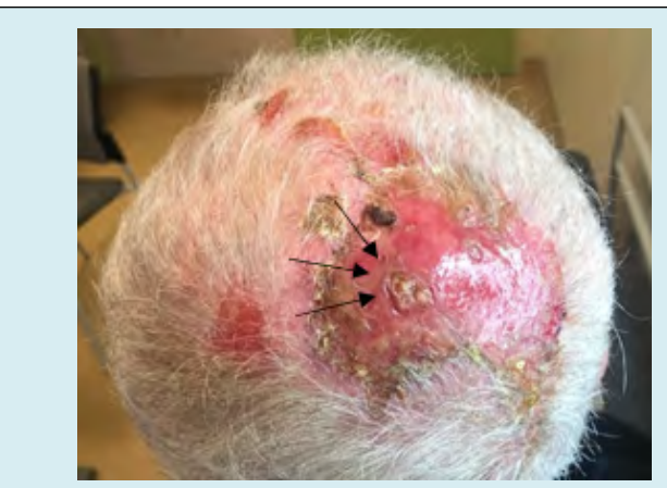
Figure 2: Multiple erosions, pustules (black arrows) and purulent drainage.

However, dermal elastosis with atrophic hair follicle, suppurative folliculitis and a lymphocytic and neutrophilic infiltrate were found (Figure 3) and were consistent with the