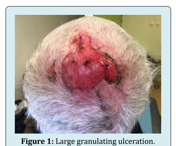
A Large Erosion of the Scalp Clin Dermatol J

recent satellite erosions (Figure 1). Further biopsies were performed to rule out a transformation into carcinoma. Two weeks later, the patient presented the same erosion with crusts, and rare pustules (Figure 2). The diagnosis of erosive pustular dermatosis of the scalp (EPDS) was suspected. The second set of biopsies showed ulceration without tumour cells.