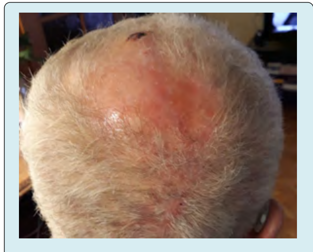
Figure 4: Complete healing with cicatricial alopecia.

To conclude, identifying EPDS is crucial to initiate the adapted treatment to prevent cicatricial alopecia and avoid unnecessary therapeutics that can worsen it, such as surgery of precancerous lesions or carcinomas [2].