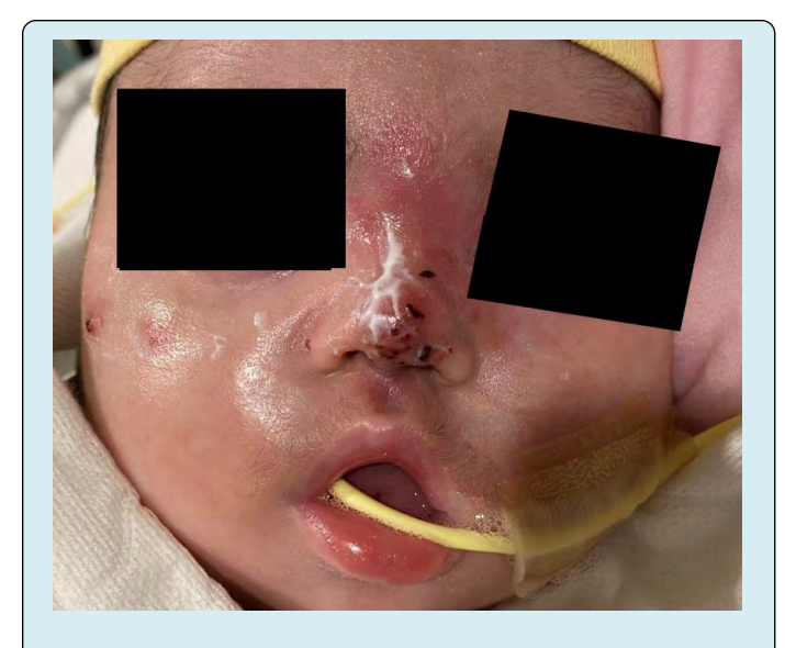
Figure 2: Gradual resolution of previously described lesions.