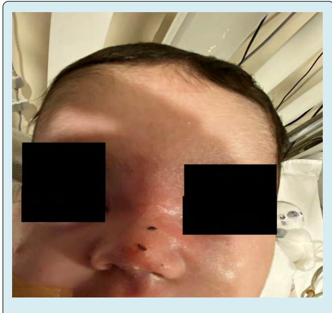
Figure 3: Further improvement of previously described lesions.

The laboratory results were as follows: hemoglobin, 9.4 g/dL; white blood cells, 4700/mm<sup>3</sup>; absolute neutrophil count, 366/mm<sup>3</sup> (22%); platelets, 30,000/mm<sup>3</sup>; C-reactive Protein – 300 mg/L (normal up to 5 mg/L). Antibiotics shifted to intravenous meropenem (20 mg/kg per dose 8 hourly) and Vancomycin (15mg/kg per dose 8 hourly) after collecting blood, and skin lesion samples.