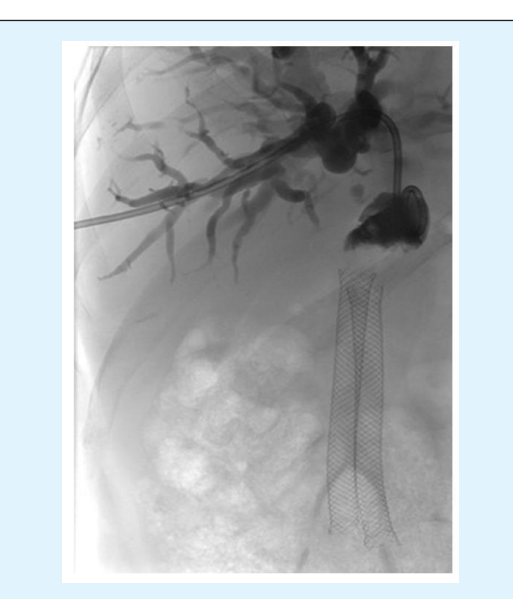
Figure 3: PTC in the common hepatic duct revealing obliteration of the SEMS before clearance and acetylcysteine treatment.

Arnelo U. Continuous Intrabiliary Acetylcysteine Infusion Allowed Perioperative Chemotherapy in a Jaundiced Patient with Malignantly Transformed IPMN and Pancreatobiliary Fistula. Gastroenterol Hepatol Int J 2017, 2(2): 000124.