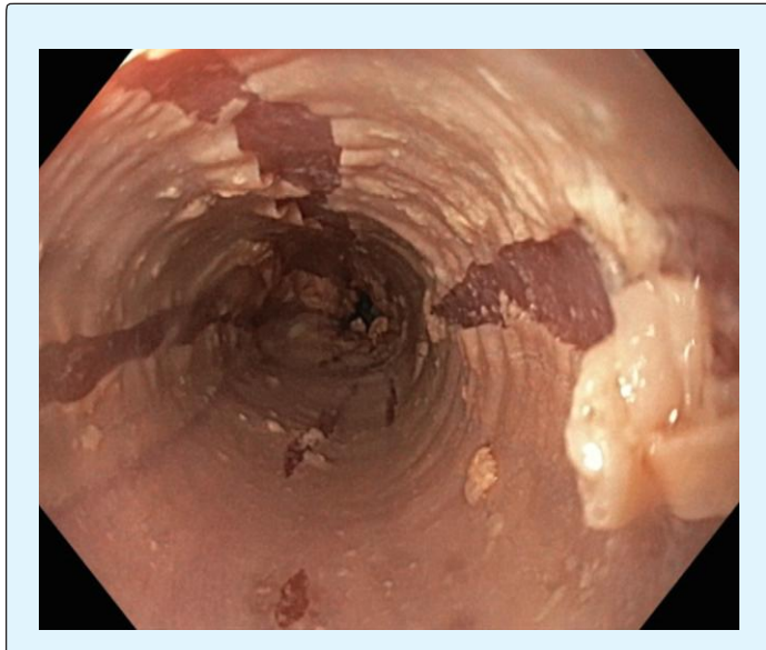
Figure 1: Upper endoscopy revealed the presence of streaks of peeled desquamated esophageal mucosa with circumferential cracks and long linear mucosa break.

separated from the underlying squamous mucosa (Figure 3). These endoscopic appearances were consistent with esophagitis dissecans superficialis (EDS), also known as sloughing esophagitis. The patient was treated with oral proton pump inhibitor (pantoprazole 40 mg daily) for a week. A follow-up EGD showed complete normalization of the esophageal mucosa.