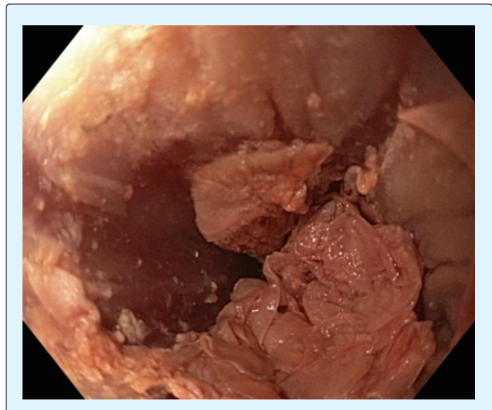
Figure 2: Endoscopic view of the lower third of the esophagus revealed clumps of exfoliated esophageal mucosa.