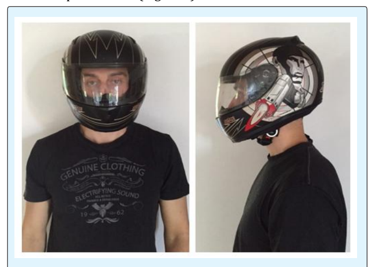
Figure 1 (a): Masking with motorcycle helmet