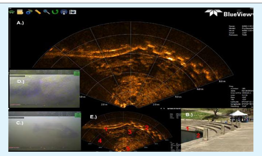
Figure 4: A) View from multi beam imaging sonar of the bayou floor. In the sonar imagery bright regions represent strong acoustic reflections from either hard materials or objects angled towards the receiver. B) Photograph of the survey region showing: 1) concrete steps, and 2) corrugated metal. C) Largemouth bass (fish). D) Boulders in the stream channel. E) Sonar image with interpretation of significant features: 1) concrete steps, 2) corrugated metal, 3) debris/tires, 4) muddy bayou floor, and 5) fish.