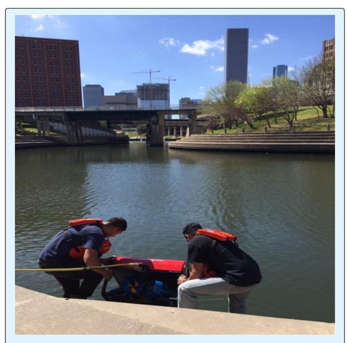
Figure 2: Launching the Predator II ROV into White Oak Bayou on the UHD campus.

We were able to acoustically image objects \sim 10 meters in front of the ROV. The sonar could return images of regions underwater where the suspended sediment would not permit optical imaging. Moreover, the video systems provided ease of recognition for targets once the vehicle was maneuvered into a position close enough ( \sim 1 meter). As well as controlling the ROV, students were able to manipulate the sensors to improve the images viewed and recorded.