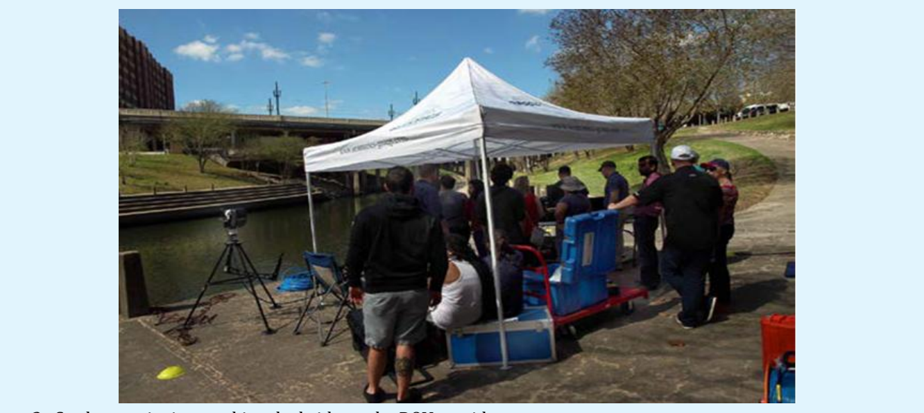
Figure 3: Students enjoying working dockside on the ROV topsides.

student questions about features. We found that the depth of the bayou varied from ~0.5 meters in the northern reaches to 2 meters beneath the Heights Bike Trail Bridge in the south. To student delight, several fish (~10 inches) were observed in the deeper parts of the bayou. We were also able to identify several carts, cables and large boulders in the stream channel that could be potential hazards for recreational water users and small boats.