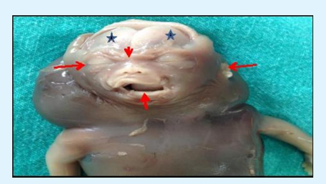
Figure 2: Facial dysmorphology: Hypertelorism, low set ears, flat nasal bridge & macrognathia. Skin over scalp withdrawn& parietal bones are visualized.