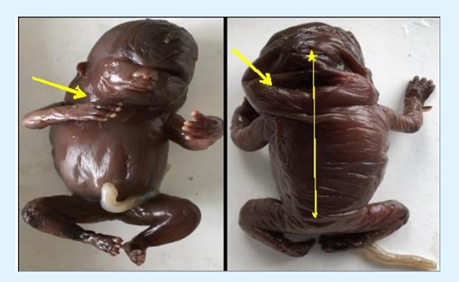
Figure 3: Female Fetus 2-16-18 Weeks: Macerated Hydrops fetalis with cystic hygromarous changes around the neck & skin on the back is wrinkled.

Impression: Female fetus with Non- immune Hydrops fetalis and cystic hygromatous changes around the neck.