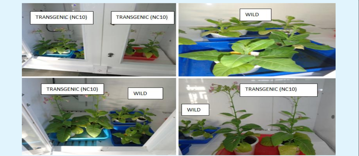
Figure 1: Elevated temperature (32°C) and carbon dioxide (500ppm), transgenic plants with more biomass and height capturing more carbon dioxide from their environment.

LlaNAC over expressing Nicotiana tabacum line NC10 (generation T2) was studied for biomass characters [5]. Each individual plant was tested for its genetic uniformity/stability based on herbicide tolerance assay (150 ppm paromomycin) and a real time PCR assay following [6]. The native growth conditions, i.e., temperature ( 25 \pm 2^{\circ} C) and carbon dioxide (400 ppm) were considered as the control conditions, while an elevated temperature of 32^{\circ} C (constant) and carbon dioxide concentration of 500 ppm in a plant growth chamber (LT-105, Percival Scientific, USA) was considered as experimental (Figure 1).