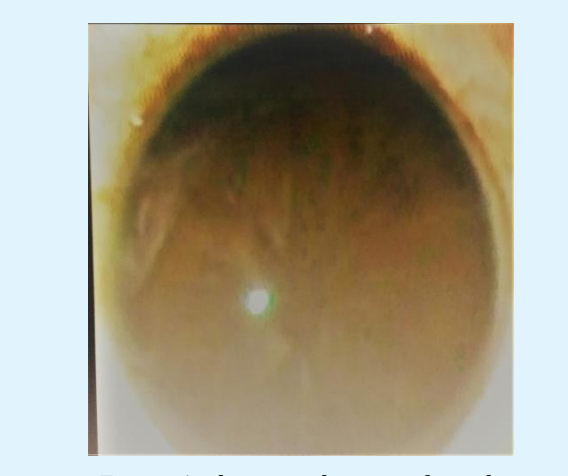
Figure 1: showing absence of pupil.