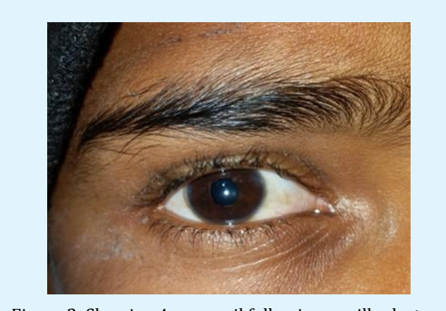
Figure 3: Showing 4mm pupil following pupilloplasty.