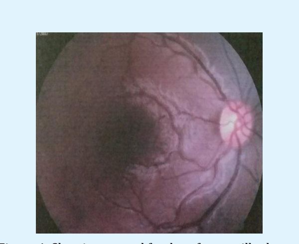
Figure 4: Showing normal fundus after pupilloplasty.