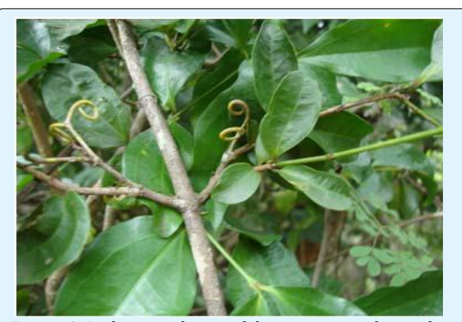
Figure 1: Inclusion scheme of the patients in the study.

anthelmintic activity in pherithima posthuma . All the concentration prepared was paying dose dependent anthelmintic activity.