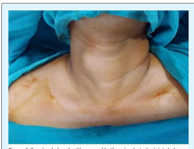
Figure: fully extended neck with exposed both costo-clavicular joints below and lower mandibular border above. Laterally upto both acromion exposed with interscapular shoulder support and silicon ring under occiput region.

Correct optimal positioning is critical for proper exposure of thyroid bed and approach for maneuvers. After general anesthesia and endotracheal intubation, patient should be kept in supine position with full neck extension supported by sand bag underneath interscapular region and a silicone gel or sheath under occipital region. Neck extension makes the swelling more prominent and surgical landmarks more visible. For draping, take three sheets of cloth, across and under head region. Drop one sheet on operation table, one over the shoulders and upper most to cover head and face region upto the mandible lower border or chin. Both clavicles with both side costoclavicular joints below, mandibular lower border above and acromian process on both sides should be visible for proper exposure. Neck should be centralized. Operative table lights should be adjusted in lower part of neck.