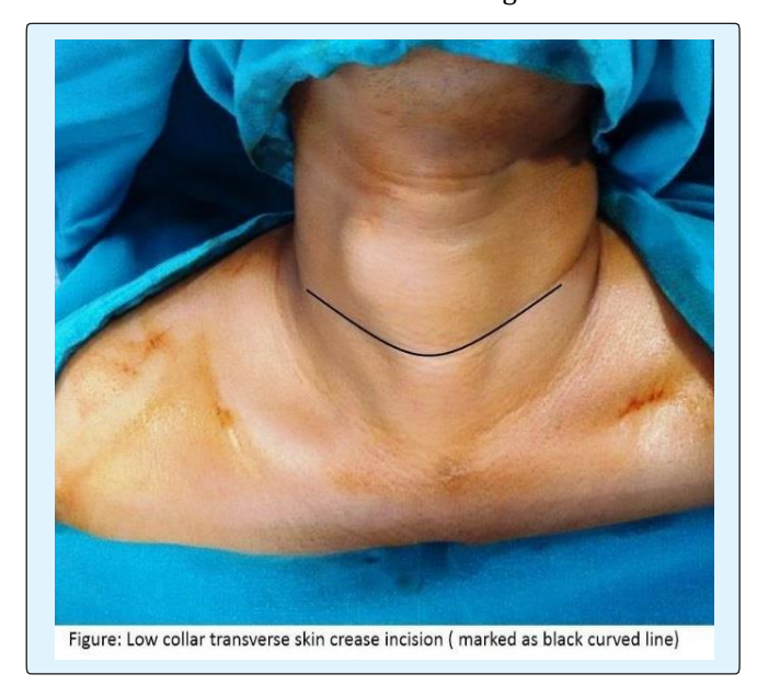
NOTE: After incising skin, platysmal should be incised with electro-cautery to avoid bloody field and mid portion of platysmal is thinner than lateral.

Incision in thyroid surgeries is constant if no additional neck procedure is planned. Classically described as low collar transverse skin crease incision is adequate for total thyroidectomy, while it can be limited ipsilateral if hemithyroidectomy planned in one side. Skin crease or Langerhans' line incision is along the natural skin crease or fold demarcated by folds on neck flexion about 1.5-2cms above from sternal notch or costoclavicular joints. While inextended neck, it appears as skin marks or grooves. Laterally it extends on both sides upto anterior borders of sternocleidomastoid muscle. Sometimes in huge tumors incision size may be extended more laterally. If unilateral or bilateral neck dissection is also planned, then the same incision may be extended in same side as "I"shape or "U" shape incision upto the mastoid tip. Benefit of skin crease incision is cosmetic demanding and good minimal or scars less healing. Skin incision mark can be infiltrated with local anesthetic with adrenaline before 3 minutes of incision to reduce bleeding.